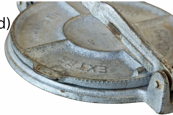
Mexican Tortilla Maker